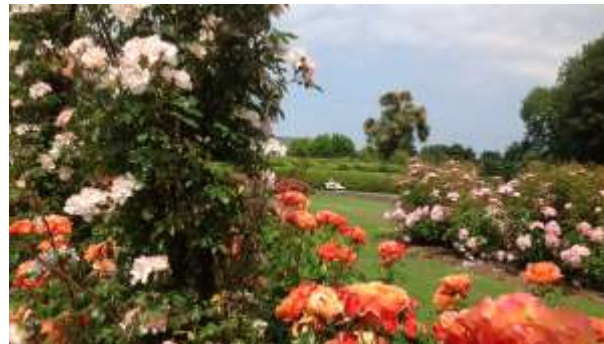
Rose Garden, Drumalis